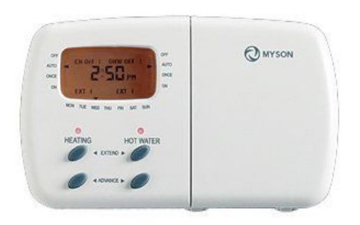
Myson duel channel programmer MEP2C